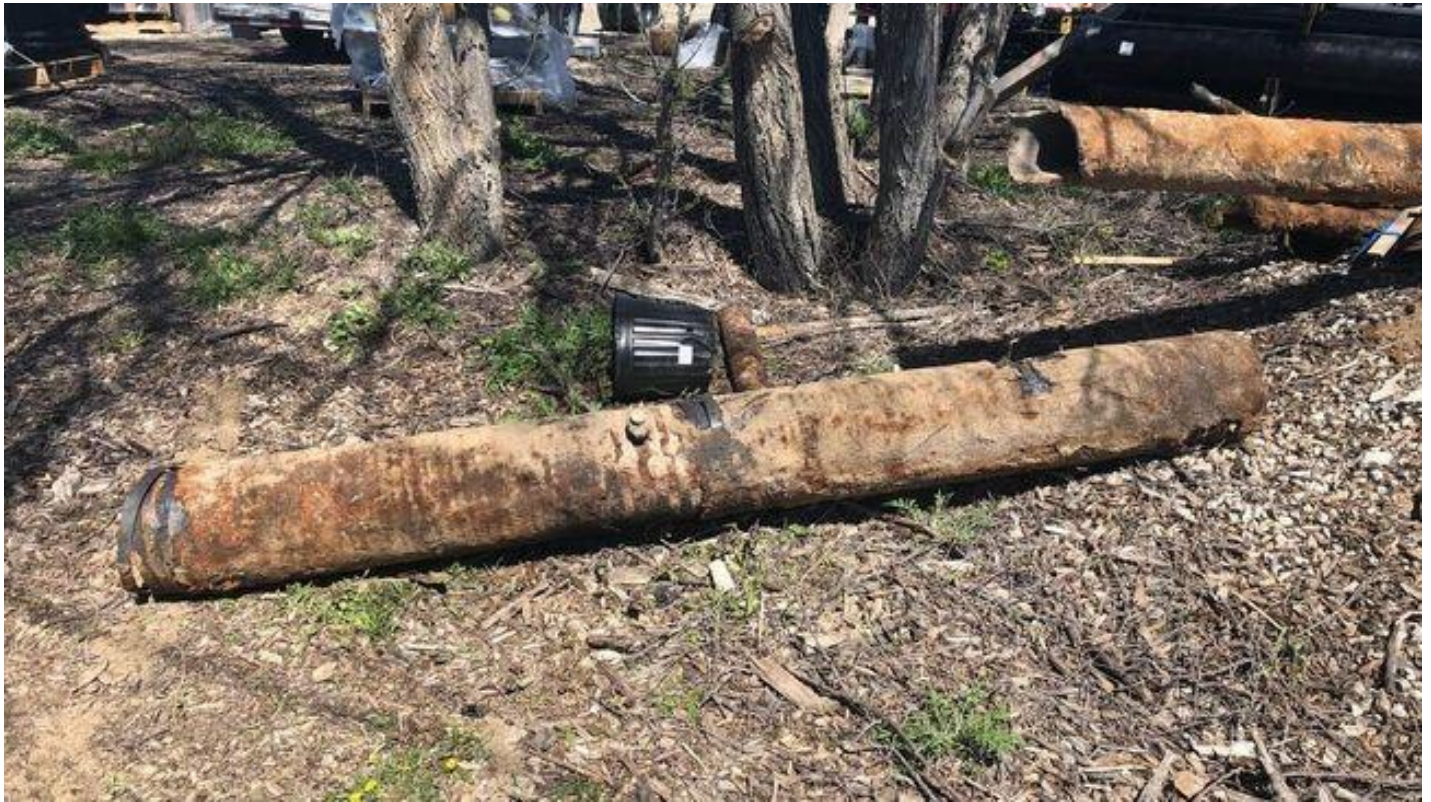
Construction crews found the wooden pipe while digging up Eighth Street this week. (Brittney Buti)

Construction is expected to last until mid-October.