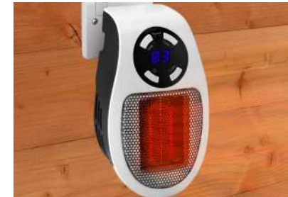
This Portable Heater Might Be the Least Expensive Heating for Michigan Homes

( https://trends.revcontent.com/d=kutDBc5uN0WlojYPg%2BFe1 )