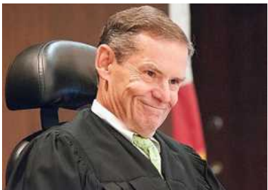
Michigan Will Pay $271/month off Your Mortgage if You Have No Missed Payments

( https://trends.revcontent.com/d=oDHZljXuLo%2BILH6rCAAFLo )