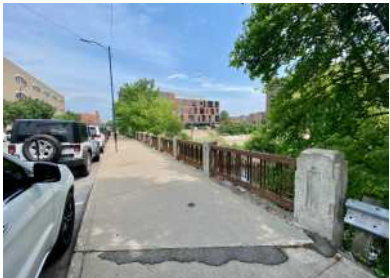
Traverse City Averages $4.5 Million In Projects Annually. This Year? $32 Million

( https://trends.revcontent.com/d=2ENb9sP1Aet%2Fnf98UFpbl )