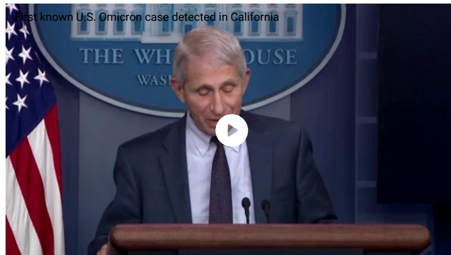
First known U.S. Omicron case detected in California