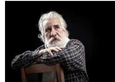
These Are the Top Financial Advisors in Traverse City

( https://trends.revcontent.com/d=e9mzSYOHoPVRswgp%2BjTf )