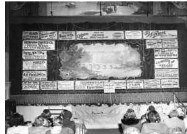
From Labor To Race Relations To Grasshoppers, Traverse City Had A Rough Time 100 Years Ago

( https://trends.revcontent.com/d=z0fQIG7Wj1RB5yyZ8DsigrmZ )