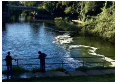
Monitoring Work Starts Monday At Union Street Dam

( https://trends.revcontent.com/d=2ENb9sP1Aet%2Fnf98UFpbl )