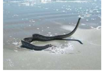
The Animal Most Likely to Kill You in Every State, Michigan is Terrifying

( https://trends.revcontent.com/d=qg9auTHx64JeUJfsbk1Hwk4 )