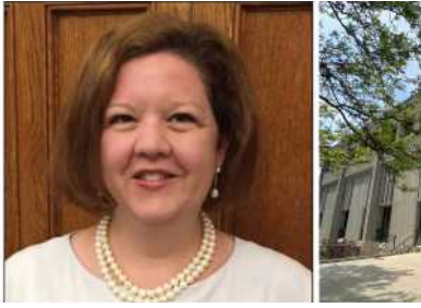
Traverse City Treasurer Fired, Cause Undisclosed; City Commission Vote Required To Uphold Termination

( https://trends.revcontent.com/d=4W0%2FFD8cGB4y2HnGo7oi )