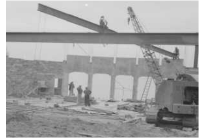
58 Commencements, Van Cliburn and Lynyrd Skynyrd: A History Of Interlochen's Kresge

( https://trends.revcontent.com/d=Qm6k3WRIF0%2BBin0lkFR7 )