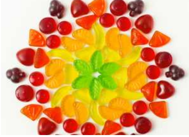
Michigan in a Frenzy : Cannabis Gummies Discovery Leaves Doctors Speechless

( https://trends.revcontent.com/d=SlwEBUvH3bDIL4II%2BocrH )