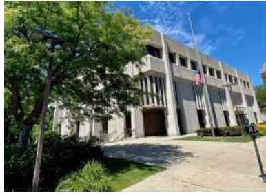
TC Voters To Decide City Manager's Spending Authority

( https://trends.revcontent.com/d=4W0%2FFD8cGB4y2HnGo7oi )